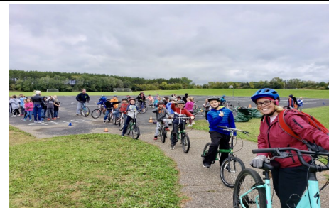
CF 4th Grade Class—May 2019